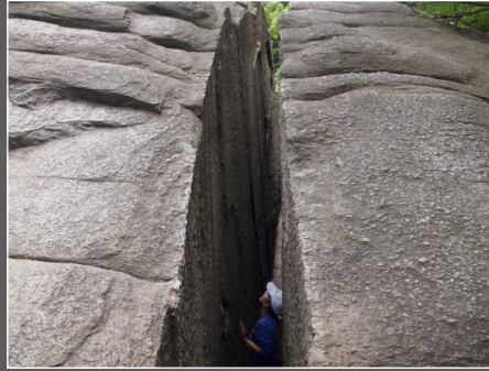
Fat Man's Misery!