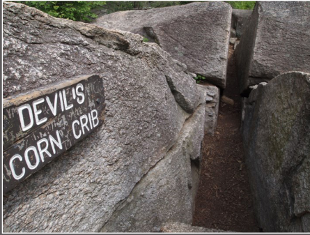
Devil's Corn Crib