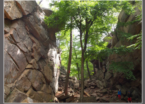
Inside the Chasm