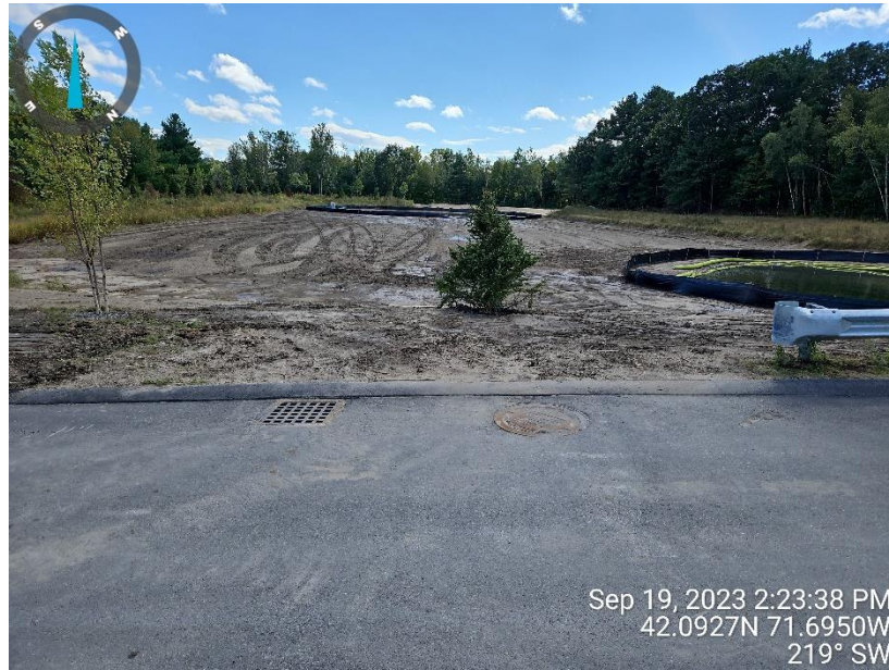
1. Recently re-graded Infiltration Basin #2