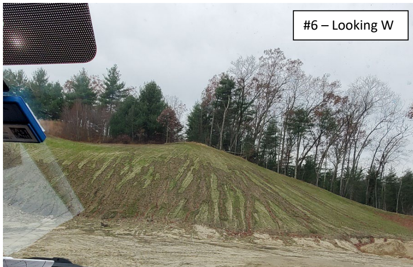
#6 – Looking W