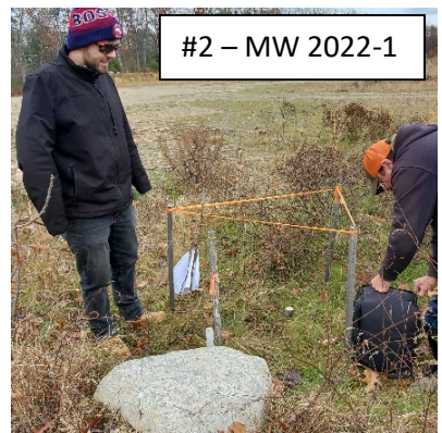
#2 – MW 2022-1