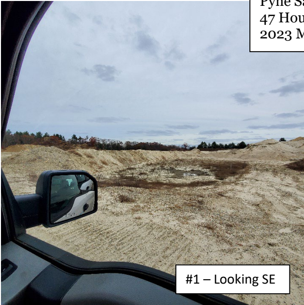
#1 – Looking SE