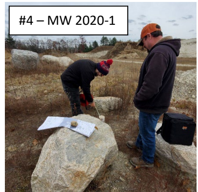
#4 – MW 2020-1