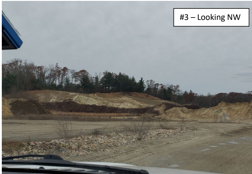
#3 – Looking NW