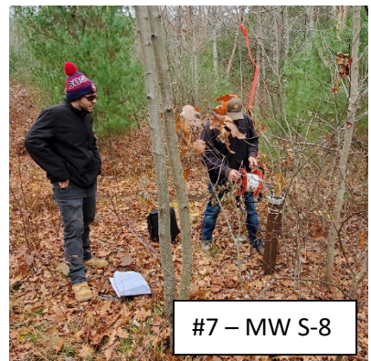
#7 – MW S-8