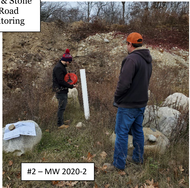
#2 – MW 2020-2