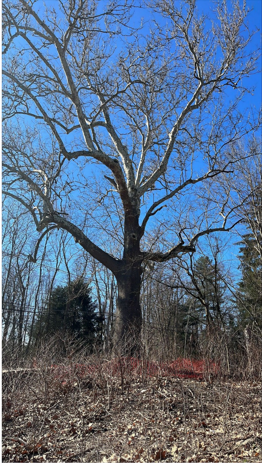
Image of assessed tree