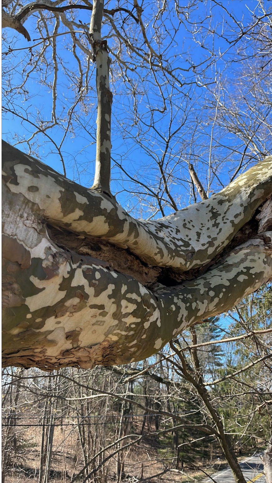
Image of decayed branch