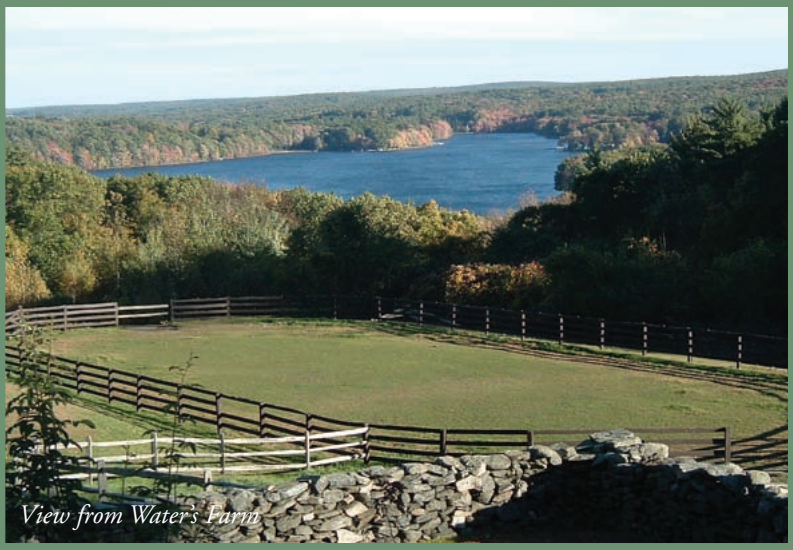
View from Water's Farm