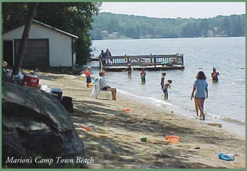
Marion's Camp Town Beach