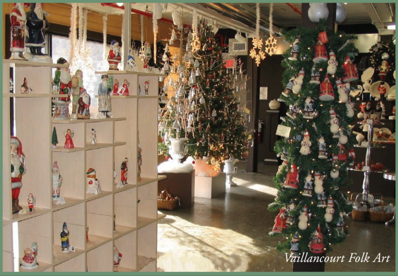
Vaillancourt Folk Art