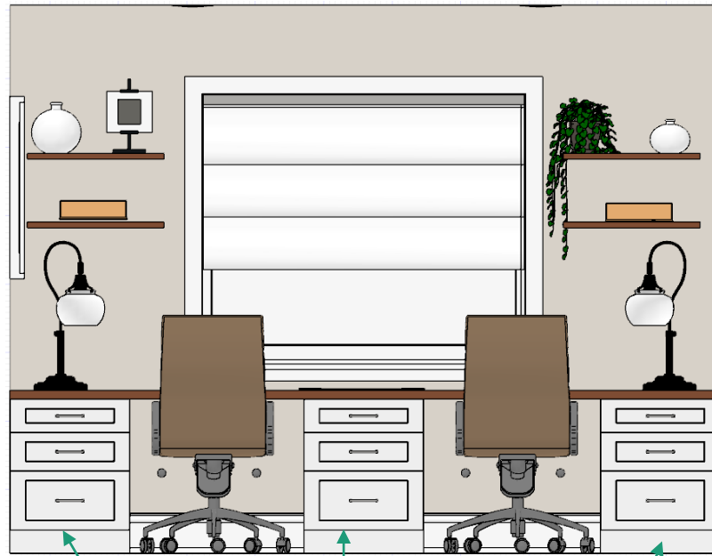
3 @ 21" w File cabinets